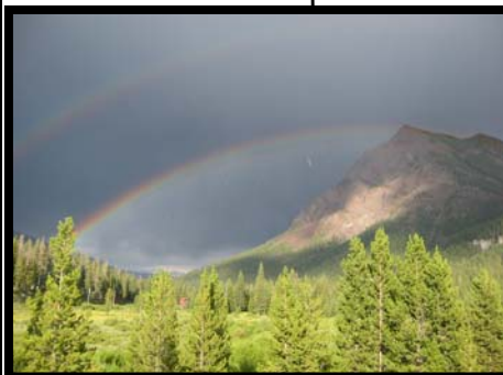
Looking east to Mt Republic

Scout's Mountain House is located 1 mile from the NE Entrance to Yellowstone National Park in Silver Gate, MT, on the famed Beartooth All American Scenic Highway. The house is ideally located at the edge of town with easy year-round access and privacy. There is a small year-round stream running through the property, which is home to spawning Cutthroat Trout; a stream restoration project with FW&P is planned to restore Willow Creek (see Willow Creek Project Assessment). The scenery is spectacular and wildlife is plentiful. Moose, elk, deer, black bears, grizzlies, wolves, fox, bison and countless birds often pass through the property.