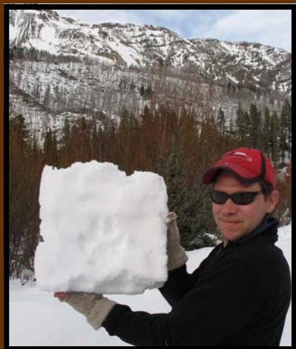
Wolf print found in our driveway