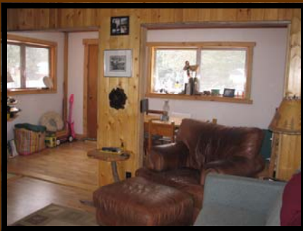
Living Room, looking toward Dining Room